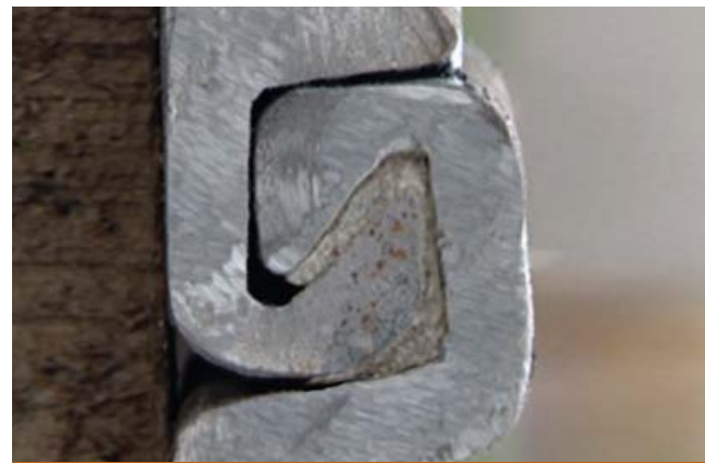
The Larssen four-point connection with joint sealant reduces permeability within EPA standards.