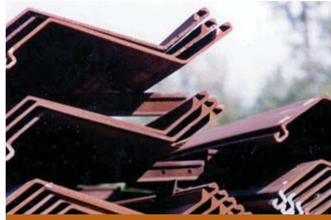
The AZ sheet pile series offers more than 20 sections to meet your environmental demands.

Skyline offers free engineering support to environmental designers and contractors. Our piling experts bring a century of steel pile systems technology through our parent company ArcelorMittal. To learn more about our steel systems and solutions, visit us at www.skylinesteel.com or to speak with a Skyline environmental engineer, call 1-866-875-9546.