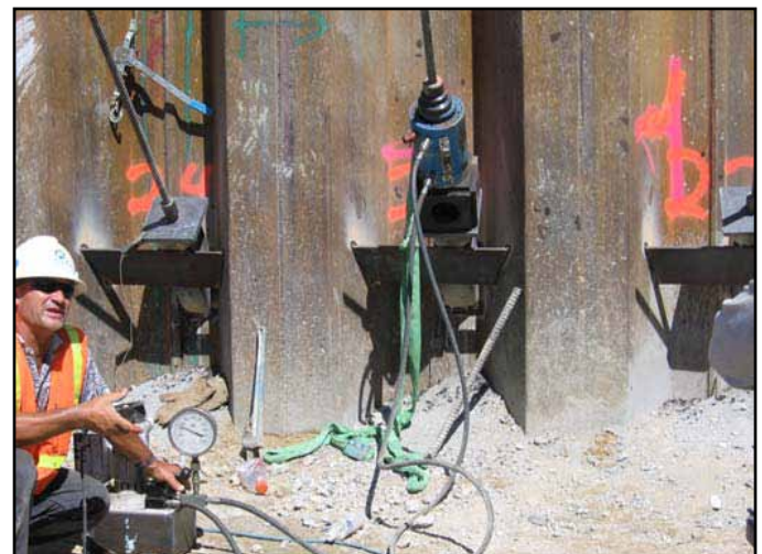
Figure 12: Installation and tensioning of tiebacks at sheet pile within conventional zone

For the temporary shoring condition within the conventional zone, sheet piles were designed as part of a braced system that included tie-back anchors (see Figure 12). For the permanent wall below grade condition and for the temporary shoring condition within the up-down zone, internal bracing is provided by the P3, P2, P1 and ground level floor slabs. Due to the potential for periodic perched groundwater, the lower section of the sheet piles was designed to resist hydrostatic pressure in addition to the active soil pressure loading.