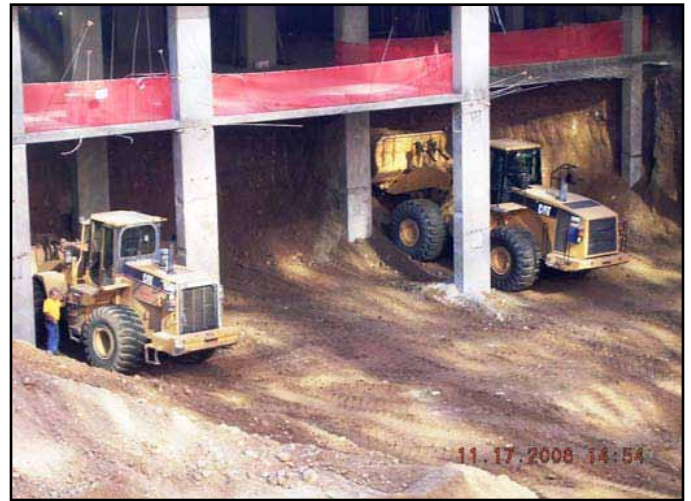
Figure 5: Mining excavation beneath P1 slab

Precast concrete was chosen for the two-story gravity columns extending from the P3 to P1 basement levels within the up-down zone due to its compatibility with the remainder of the concrete construction. Vertical reinforcing bars were extended below the bottom ends of the columns to provide a compression lap splice into the drilled shaft below, and extended above the top end of the columns to be lap-spliced or mechanically coupled with the reinforcing bar for the cast-in-place columns above.