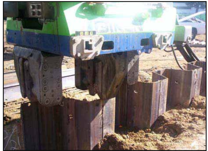
Figure 2: Installation of sheet piles

Sheet piles extending 15 feet below the underside of the eventual P3 basement level was first placed on the east, west and south sides of the site by utilizing a push press driver with an integrated auger bit to help clear cobbles. This sheet piling, with an 18-inch deep profile and nearly 3/4-inch flange thickness, would eventually become the finished basement walls.