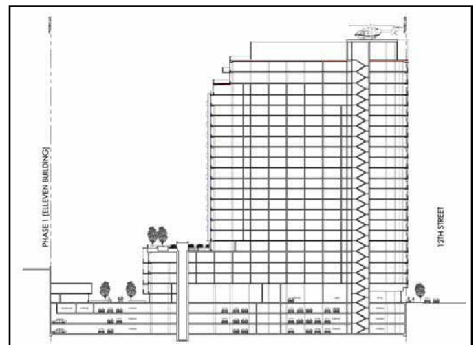
Figure 1: Section thru building looking east

60,000 square feet. It is anticipated for completion in 2008. The building footprint occupies the entire site and is rectangular in shape. It is bounded on the south and east sides by 12th Street and Grand Avenue, respectively; by an alleyway on the west side; and by a recently completed 11-story residential tower with one subterranean level, immediately to the north. See Figure 1 below.