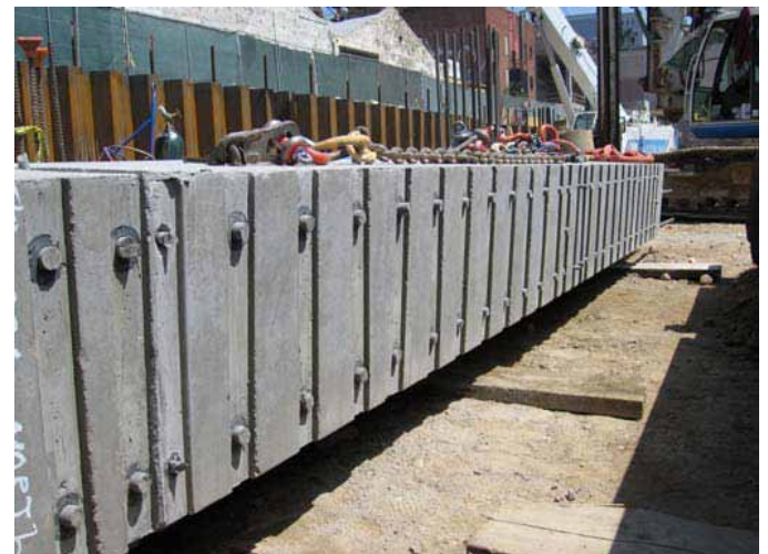
Figure 8: Precast shear wall core corner prior to installation

Construction of the shear walls below the P1 basement level began in much the same fashion as the columns, with L-shaped corners of the shear wall cores plant-cast and set atop large diameter drilled shafts. These corner elements were cast with threaded dowel inserts and horizontal keys along the entire length of those vertical faces in eventual contact with the remainder of the walls (see Figure 8). Instead of rebar dowels at their base, an embedded W12 steel wide flange section with headed shear studs was cast within and extended below each of the L-shaped columns. This W12 shape is wet-set into the drilled shaft below such that it will then be capable of transferring uplift forces due to a seismic event from the shear wall into the drilled shaft. The remaining wall panels between the precast corners were reinforced and cast in place after the completion of excavation within the up-down zone and during subsequent basement construction.