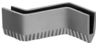
Sheet Pile Protector