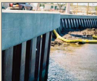
Detail of batter pile installation